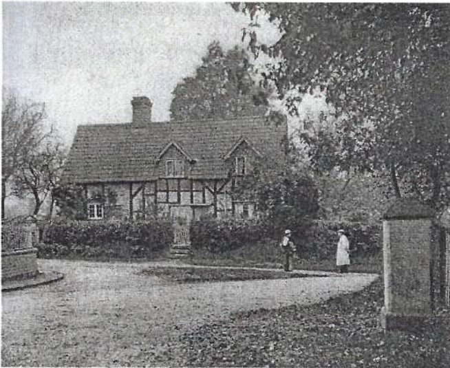
GREAT HINTON VILLAGE. Lot 27.

The land which went with the Farm varied through the 19th century but when it came up for sale in 1911 it was described as a 'useful small holding' which apart from the farmhouse had stabling for two horses, a cowshed for seven cows, and two pigsties.